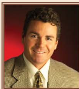
John W. Schnatter Founder, Chairman and co-Chief Executive Officer

With a continued sense of optimism, we believe Papa John's has tremendous prospects for growth and success in 2011 and beyond. We thank our franchisees, supply partners, corporate operators, team members and Board members for your continued support, and most importantly our customers for their patronage, as together we continue to deliver on our "Better Ingredients. Better Pizza." brand promise around the world.