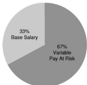
CEO Variable Pay as a % of Total Compensation